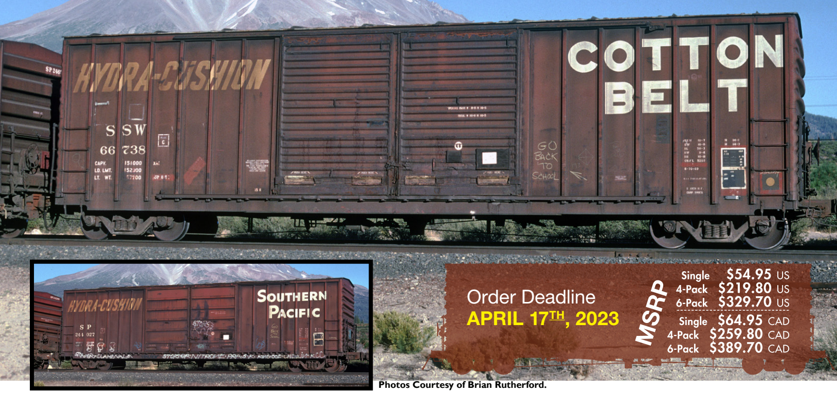
Rapido Trains Inc. is proud to announce another essential modern freight car, the Pacific Car & Foundry B-70-69/71/75 class boxcar in HO scale!

As the demand grew in the 70s for larger capacity boxcars, along with the need to replace aging 40' cars, this series of 50' double door boxes was produced by PC&F for the Southern Pacific and its subsidiary St. Louis Southwestern (SSW). Constructed between 1972 and 1975, these boxcars are 50'-7" in length with a capacity of either 5258 cu ft for standard cars, or 5119 cu ft for those equipped for DF (Damage Free) Loading. All B-70 boxcars feature Hydra-Cushion underframes and were delivered with either Youngstown or Superior doors.